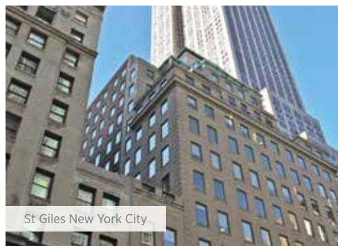
St Giles New York City