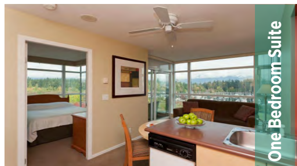
One Bedroom Suite

The hotel has a 24-hour concierge service, weekly maid service, sauna, small exercise room and free WiFi.