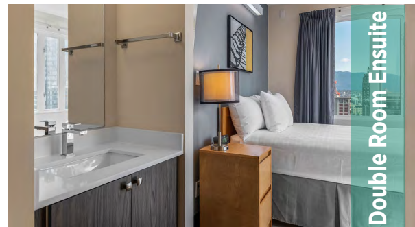
Double Room Ensuite